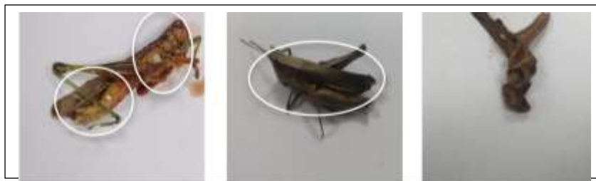
Figure. 1 Morphology of wood grasshopper infected with fungus

Gebremariam et al. (2022) reported that a single application of B. bassiana against Bemisia tabaci resulted in mortality of up to 90% at a concentration of 1 \times 10^8 conidia/mL, while M. anisopliae on the same insect species only reached 88%. The antagonistic power of these entomopathogenic fungi is influenced by spore physiology, including viability, virulence, and adhesion ability. This is supported by Ramdani et al. (2022), who stated that M. anisopliae and B. bassiana secrete protease and lipase enzymes that play an important role in penetrating insect cuticles, so that the colonization rate will be higher in suspensions with greater spore density. Similar findings were reported by Bagariang et al. (2023), who showed that entomopathogenic fungi have a spore growth mechanism on the cuticle, and then the hyphae secrete chitinase, lipase, and protease enzymes to break down the insect cuticle. After spore penetration, the hyphae develop into the blood vessels and produce toxins such as beauvericin, beauverolite, isoralite, and oxalic acid, which can increase pH and blood clotting and stop blood circulation.